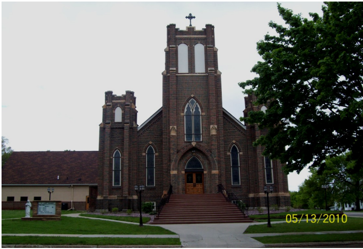
Saint Ann Catholic Church