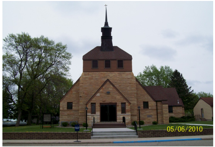
Saint Joseph Catholic Church