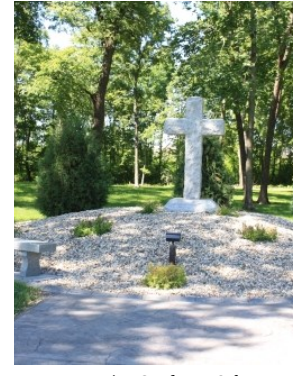
Resurrection Garden at Calvary Cemetery in Mankato

The Church insistently recommends that the bodies of the deceased be buried in cemeteries or other sacred places.